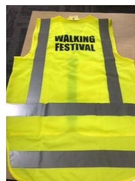
High Vis Vest with Walking Festival on the back