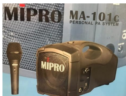
Portable PA system with microphone and shoulder strap